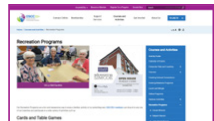
Direct Web Page