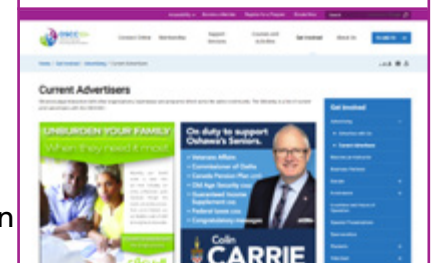
Current Advertiser Page